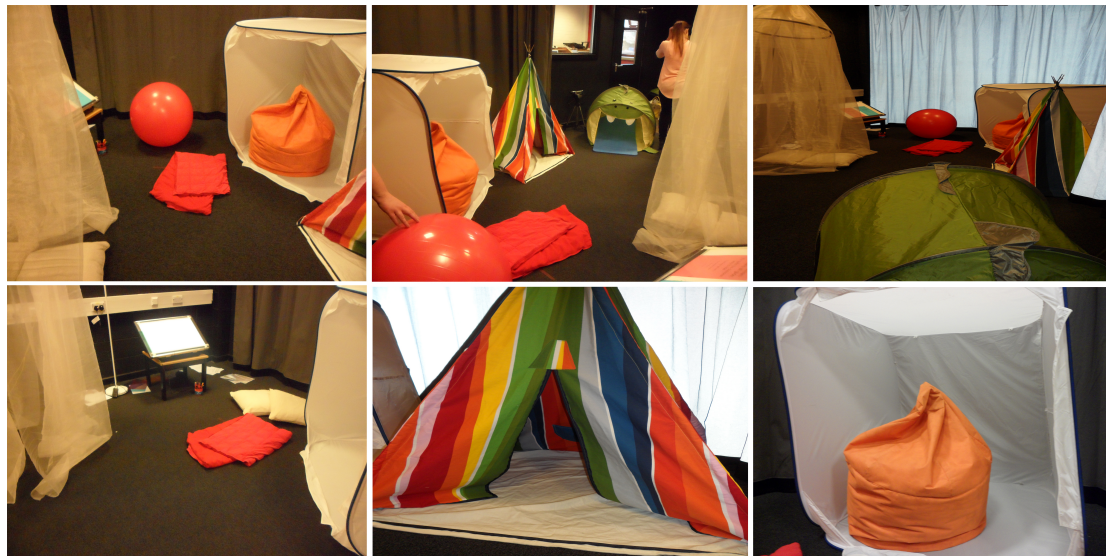
Figure 2. (Top) Four low tech, alternative pop up environments with options for how to sit, set within a photographic studio. (Source: Author).